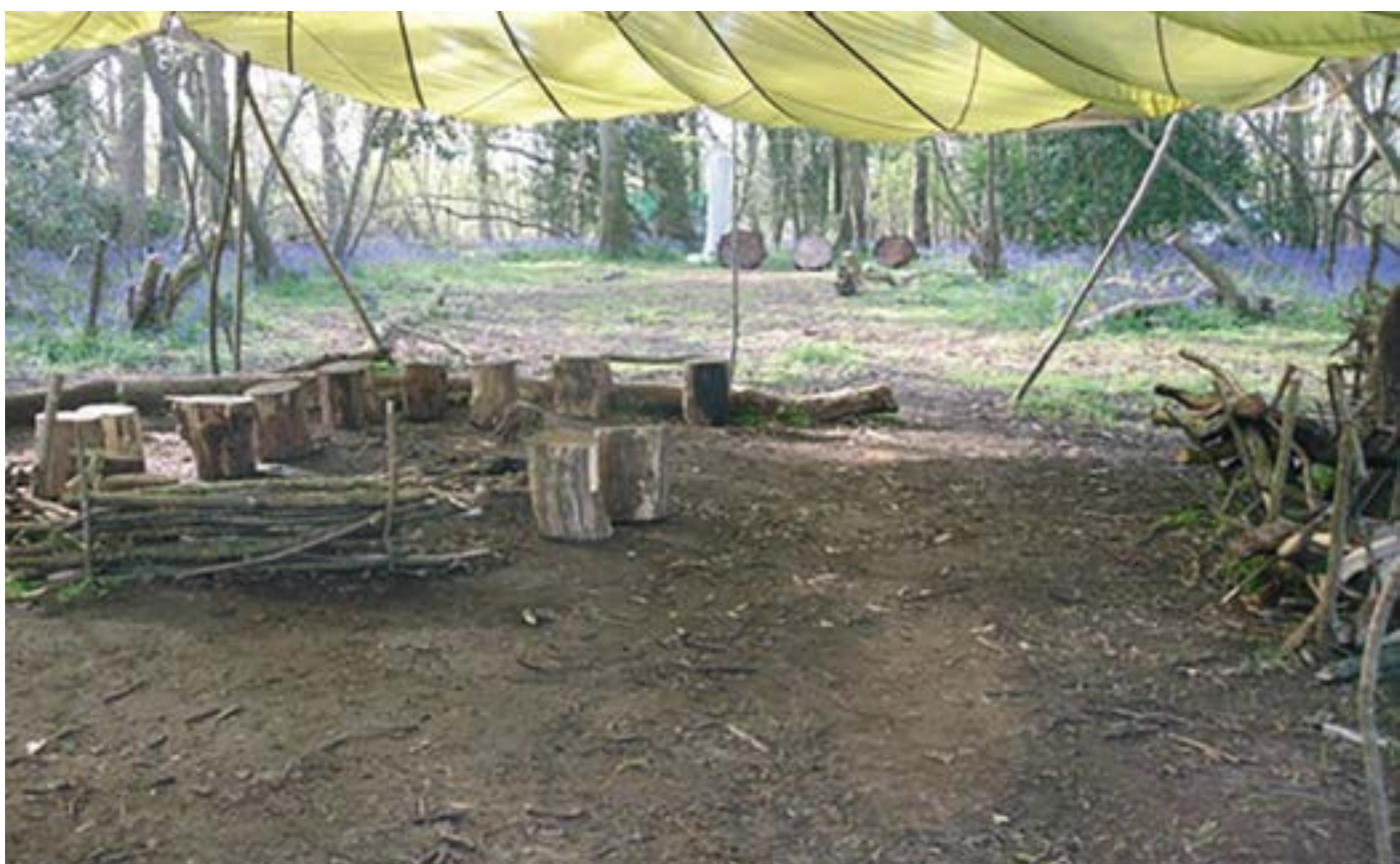
Ancient woodland damaged by camping activities.

The Standing Advice reminds planners that "ancient woodland, ancient trees and veteran trees are irreplaceable. Consequently you should not consider proposed compensation