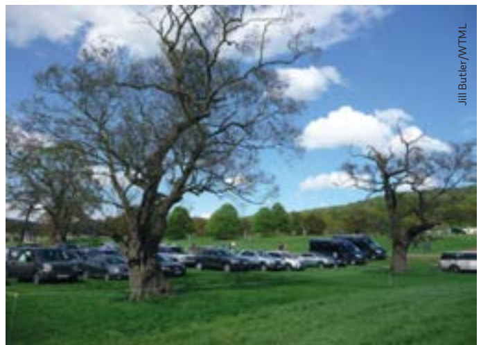
Inappropriate parking at Chatsworth International Horse Trials causing compaction in parkland.