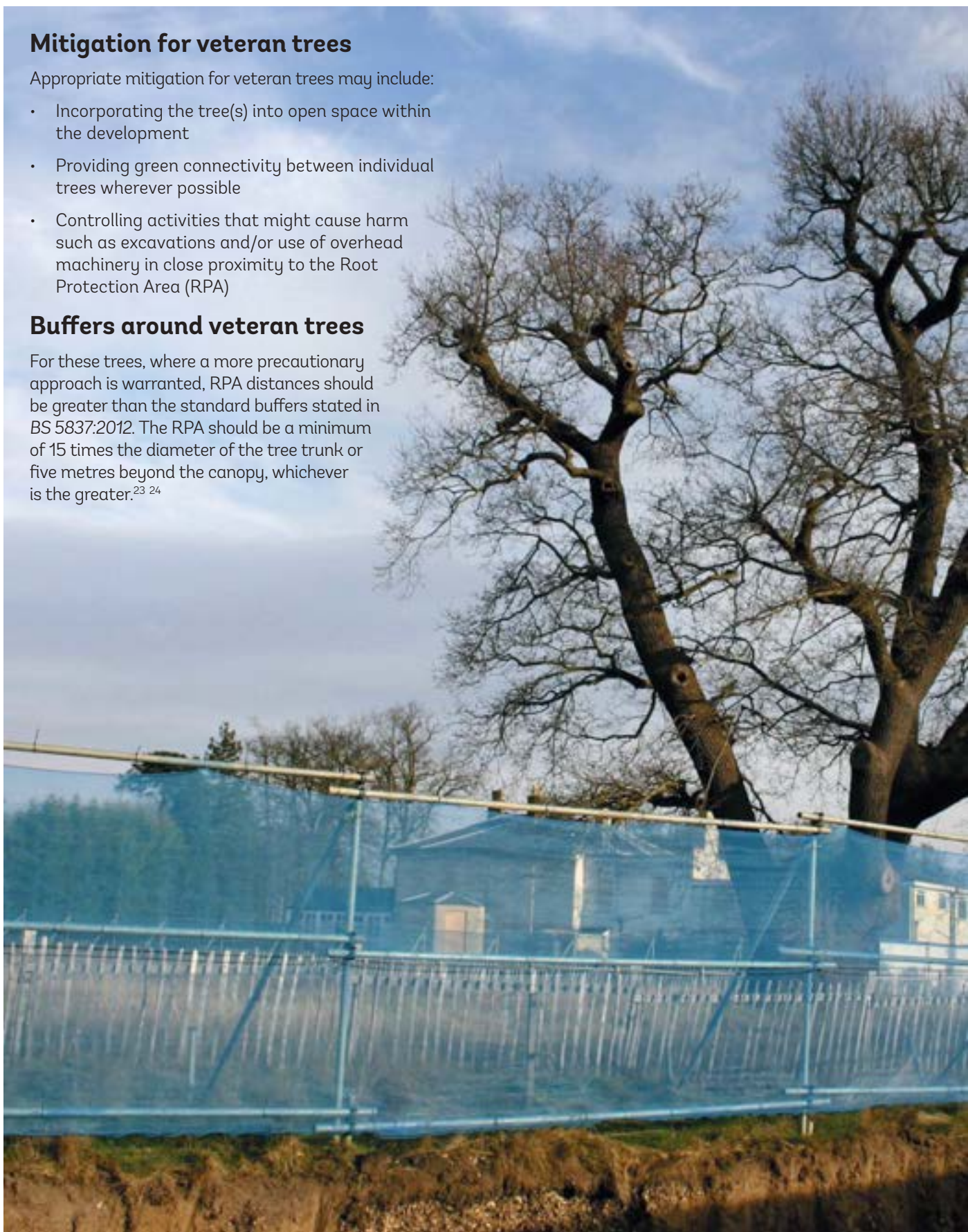
Excavation close to veteran tree

For these trees, where a more precautionary approach is warranted, RPA distances should be greater than the standard buffers stated in BS 5837:2012. The RPA should be a minimum of 15 times the diameter of the tree trunk or five metres beyond the canopy, whichever is the greater. 23 24