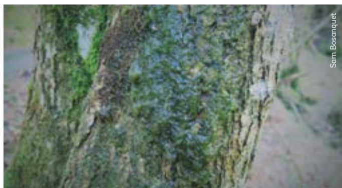
Trees covered with slimy algal 'gloop' due to ammonia pollution at Woodland Trust's Coed Gwernafon in Powys, Mid-Wales.