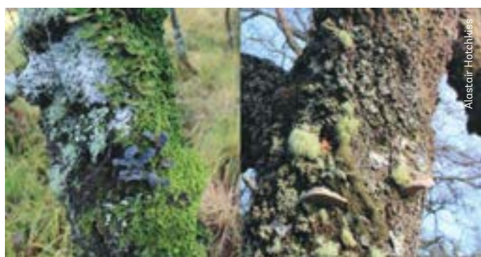
Healthy communities of lungwort lichens (left) and beard/horsehair lichens (right) on trees in Lochaber, Scotland, where ammonia pollution is very low.

Ammonia is a compound of nitrogen and hydrogen; it is a colourless gas with a characteristic pungent smell. Ancient woodland is being negatively impacted due to increasing concentrations of ammonia in the air, and as a result of nitrogen being deposited to on the ground. The Woodland Trust has recently seen an upsurge in applications for ammonia-emitting developments (such as intensive livestock units) close to ancient woodland.