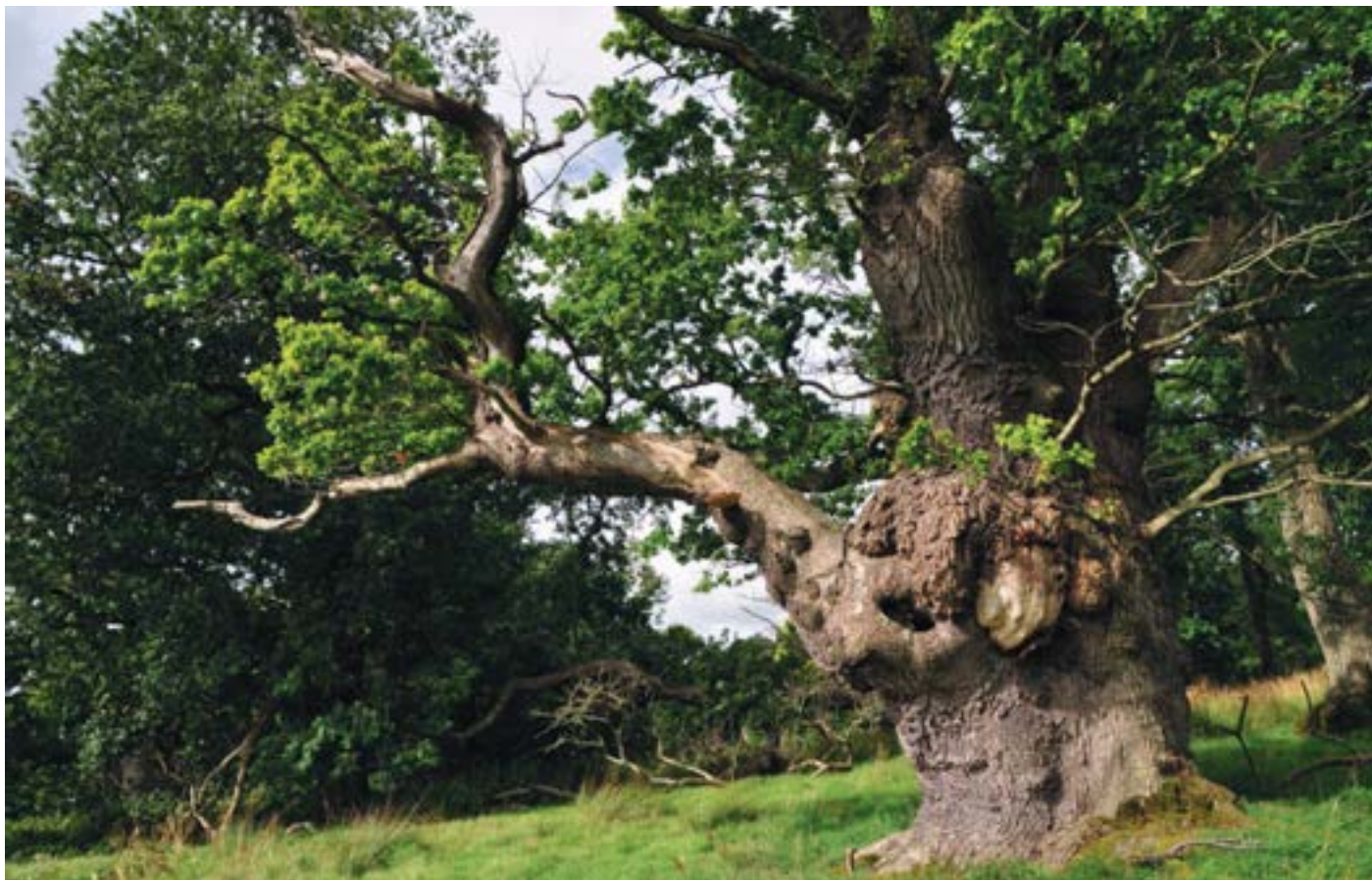
Gregynog Oak at Gregynog Hall