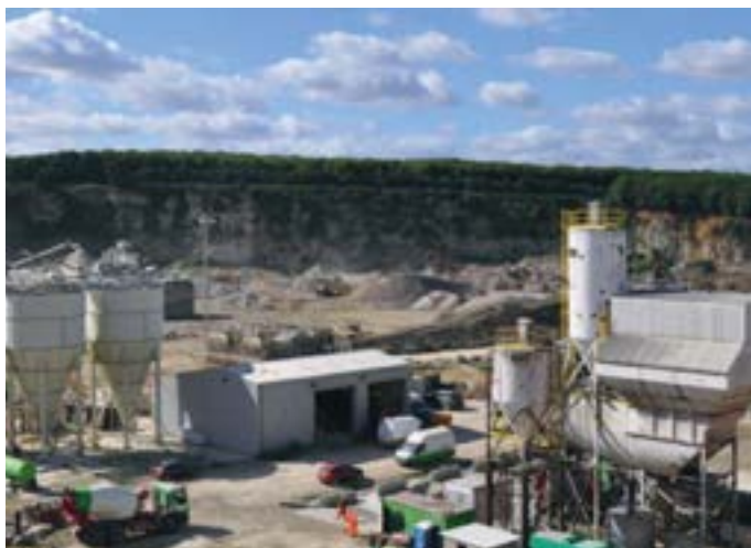
Oaken Wood, an ancient woodland in Maidstone, Kent, encroached upon by Hermitage Quarry in the foreground.