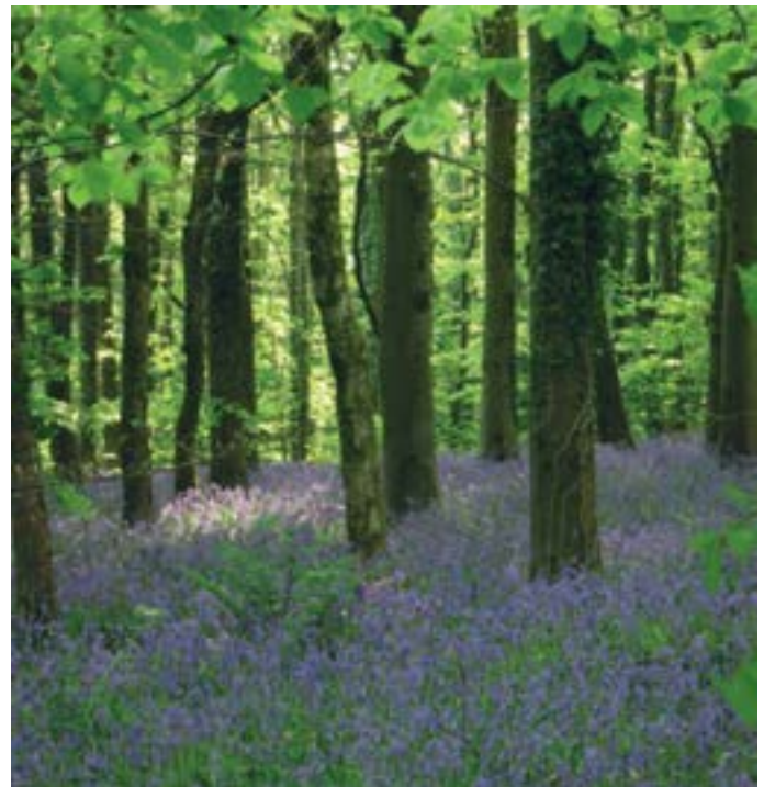
Every ancient wood is the unique product of its location, geology, soils, climate and history – conditions that cannot be re-created elsewhere

Where translocation is considered, a monitoring period of at least 50 years will be required, along with alternative plans to ensure the stated benefits will be achieved if the translocation fails. Furthermore, the new site should be identified as an ‘ancient woodland translocation site’ in the LPA’s Local Plan, and properly protected from future development.