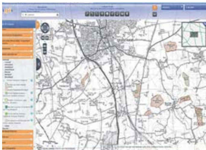
Illustrative extract from Natural England's MAGIC database

NOTE: In some counties of south-east England, sites as small as 0.5ha have been surveyed for the AWI. The results can be found in a Natural England review 14 , and the methodology outlined in that document can be followed by planning authorities wishing to refine the AWI in their area. This update is currently being rolled out across the country.