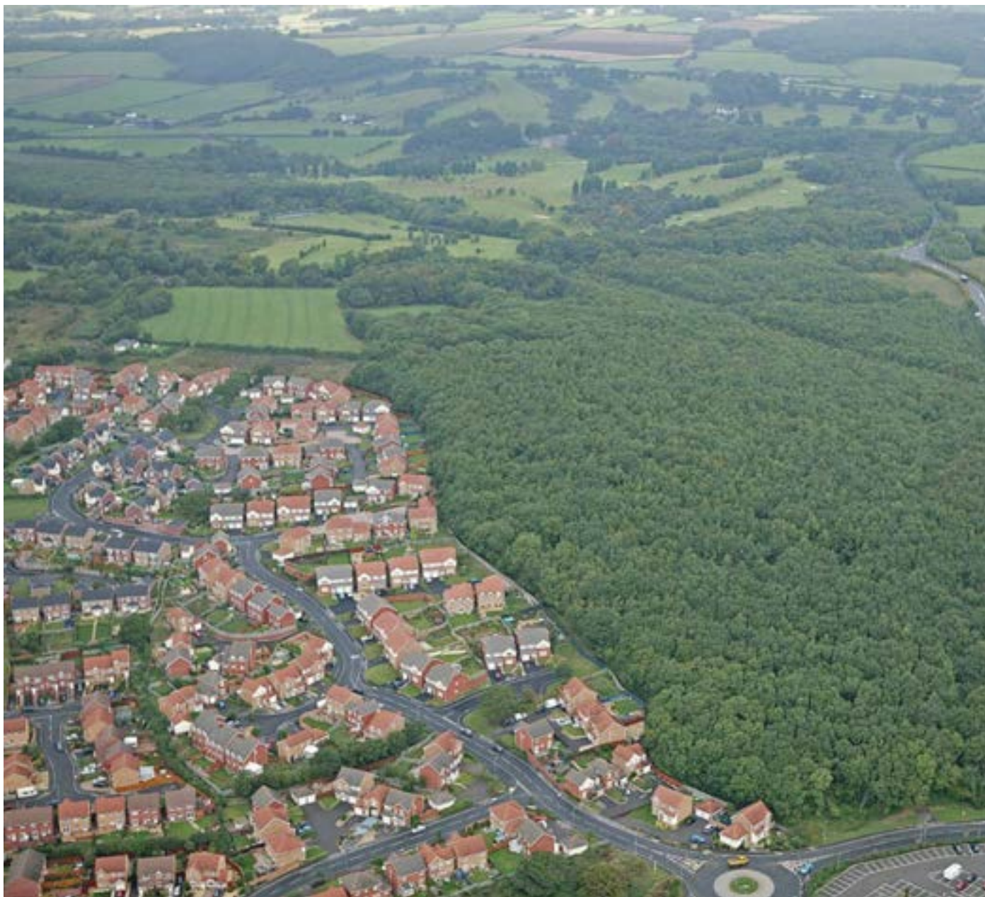
Fragmented woodland with unbuffered development at Pencoedre Wood, Vale of Glamorgan.