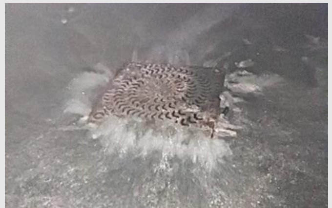
Overflowing Drain, Bosham High Street 16 th November 2022

Southern Water has become the “lightning conductor” for local frustration and since the drought finished in October, there has been plenty of evidence to show why.