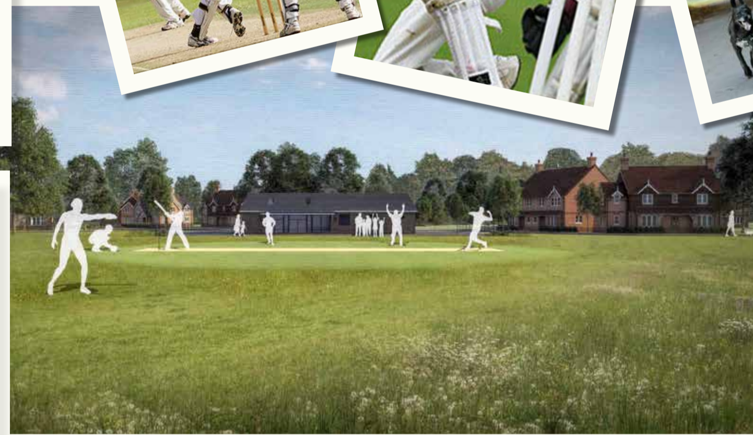
POSSIBLE NEW CRICKET CLUBHOUSE OVERLOOKING PITCH