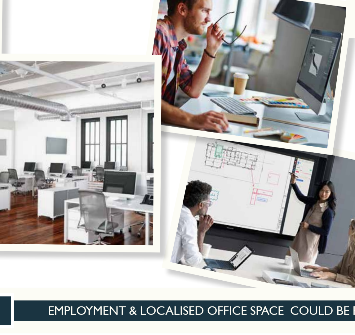
4 EMPLOYMENT & LOCALISED OFFICE SPACE COULD BE PROVIDED