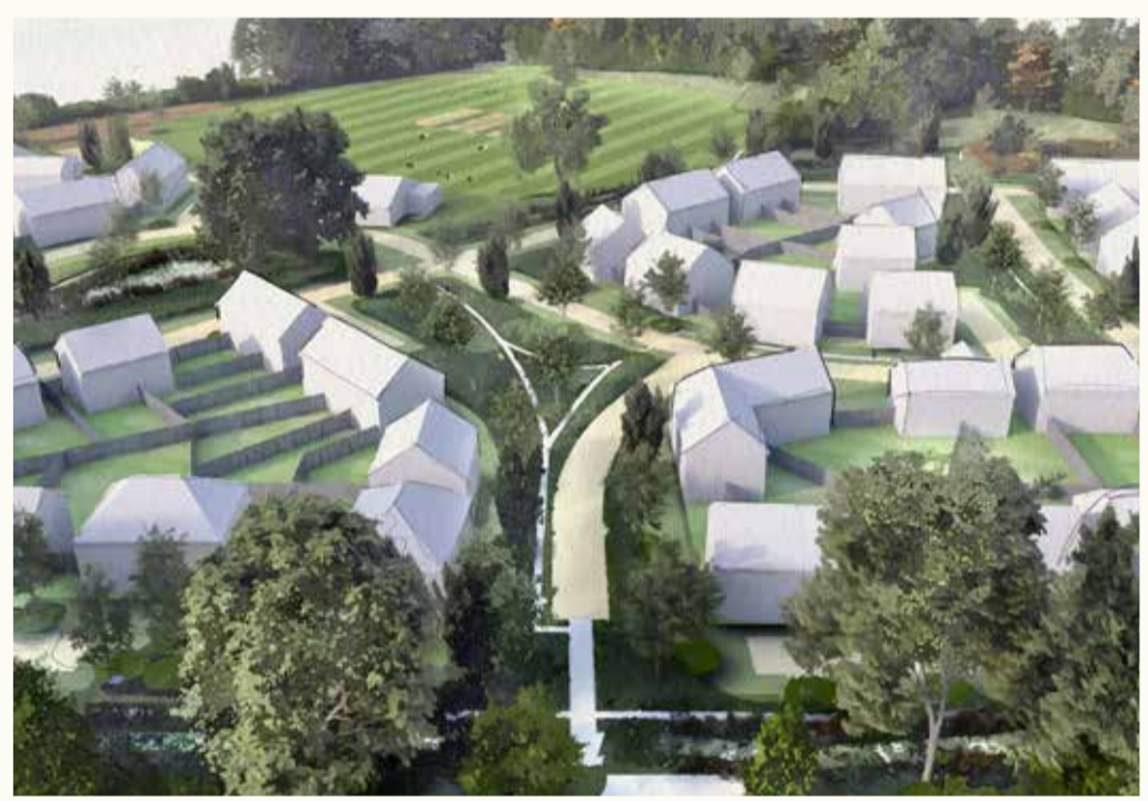
GREEN LINK THROUGH THE SITE