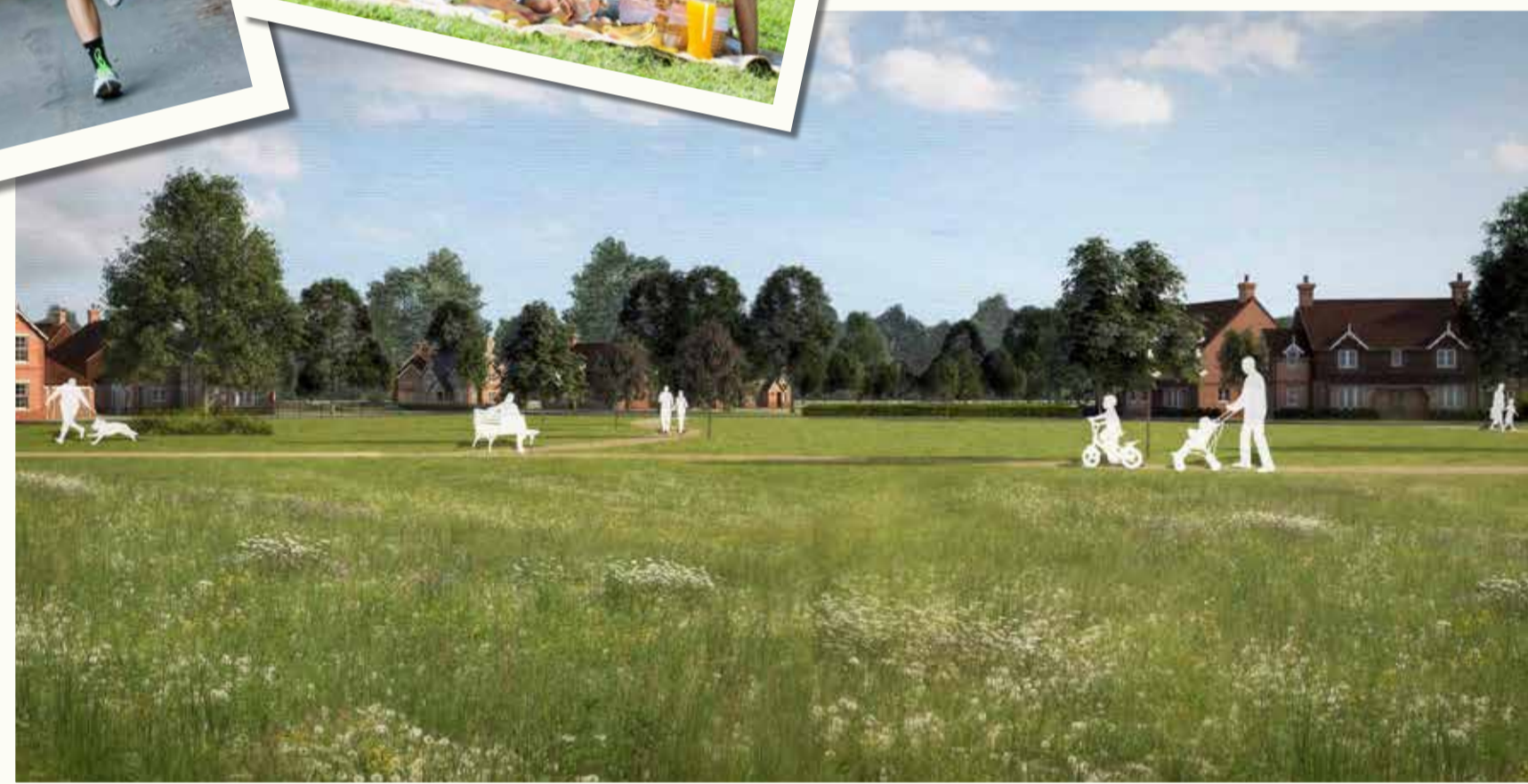
ALTERNATIVE OPEN SPACE AREA