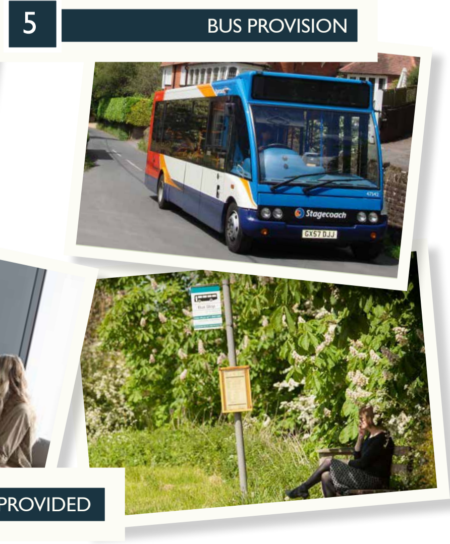
5 BUS PROVISION