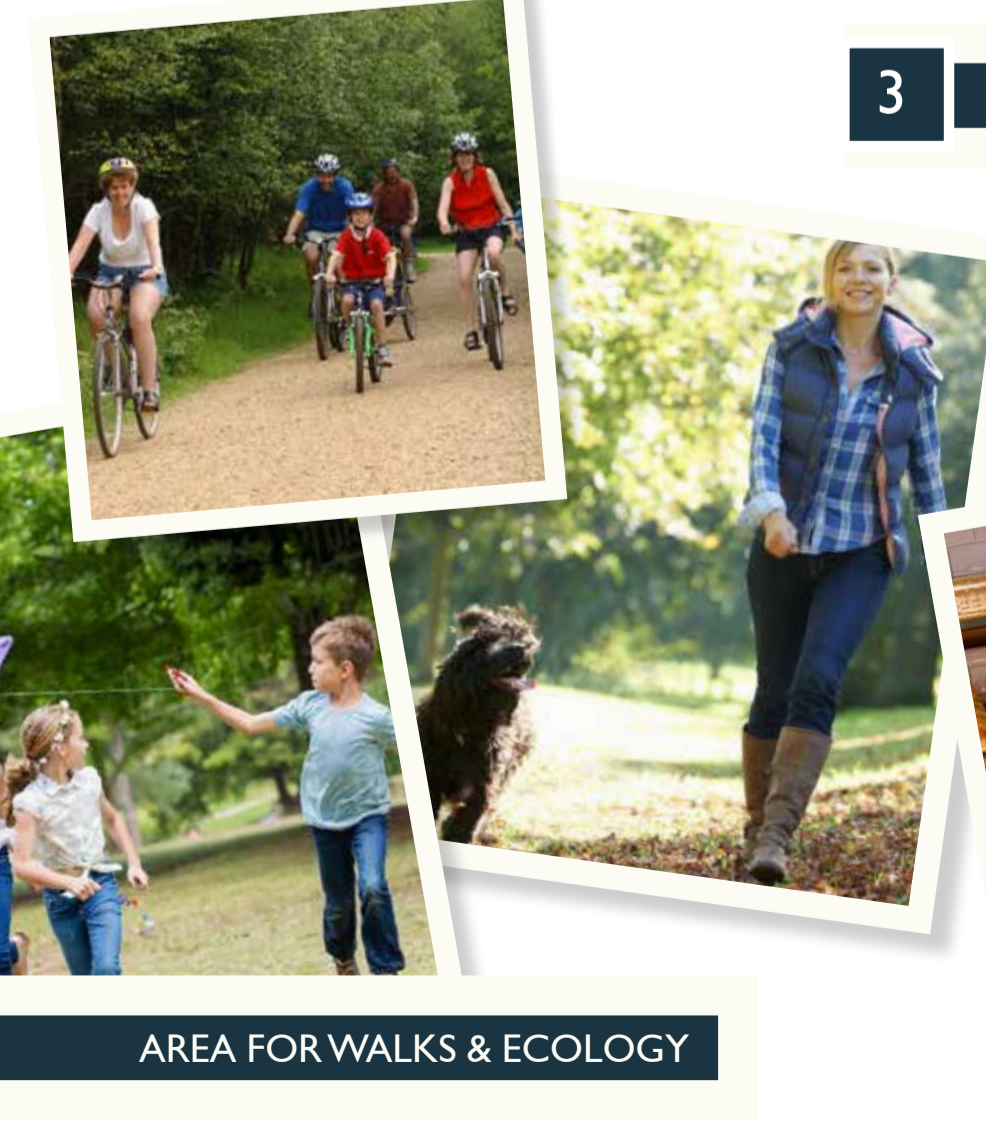
2 AREA FOR WALKS & ECOLOGY