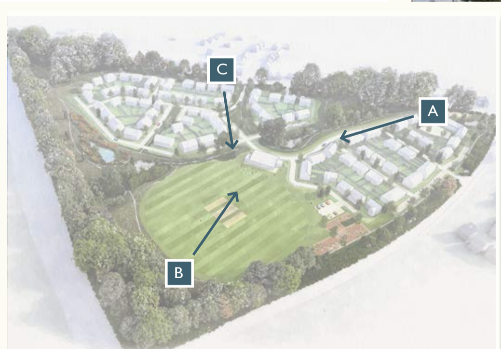
VIEW LOCATION PLAN