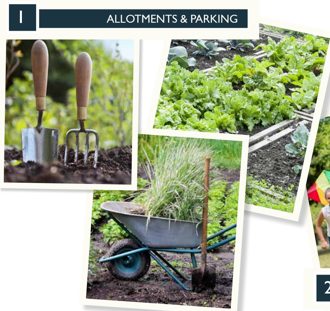
1 ALLOTMENTS & PARKING

THE DEVELOPMENT WILL HELP TO DELIVER A MIX OF FACILITIES. THESE WILL BE FOR EXISTING AND FUTURE RESIDENTS.