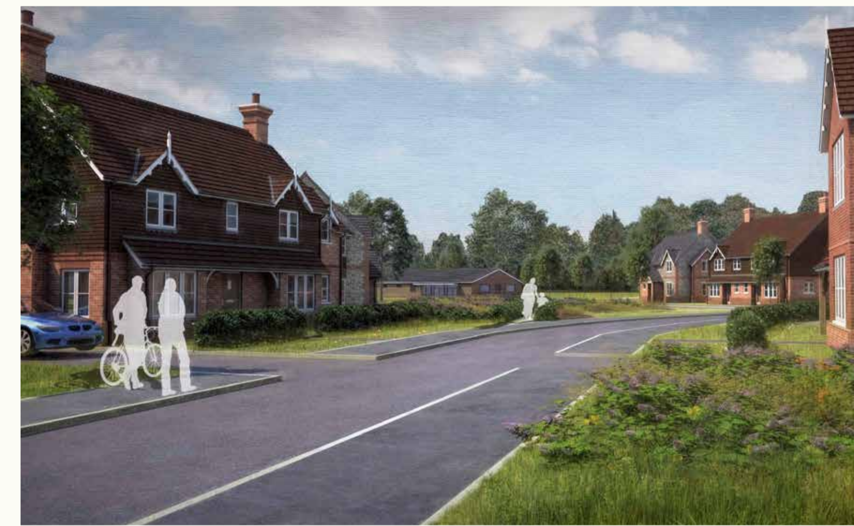
LINK FROM SCANT ROAD - WEST TO CRICKET PITCH